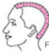
2. Front to Nape