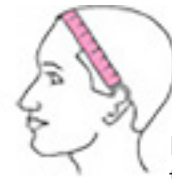
3. Ear to Ear across forehead