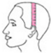
4. Ear to Ear over top