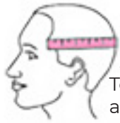
5. Temple to Temple around back