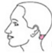
6. Nape to Neck